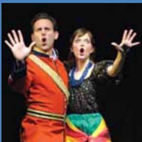
The Student Gypsy, 2008