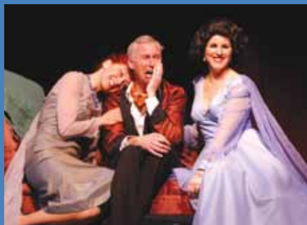
High Spirits, 2009