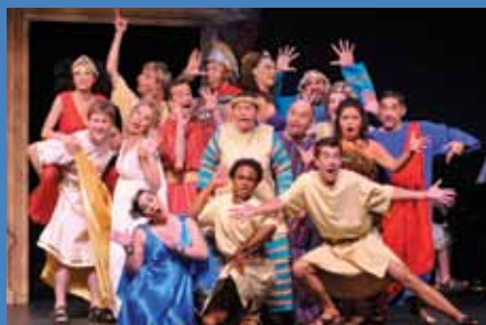
A Funny Thing Happened on the Way to the Forum, 2010